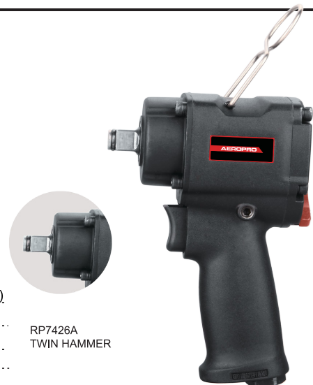
RP7426A TWIN HAMMER