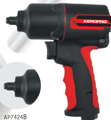
AP7424B 1/2" Anvil Available